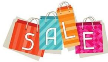
Auction of promises